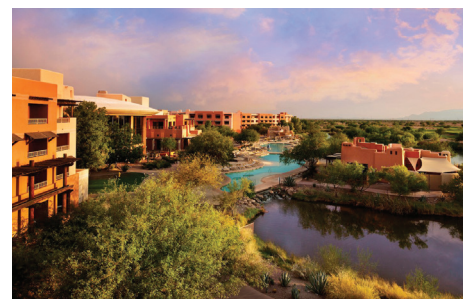
2020 Mid-Winter Institute January 29 - February 1 Sheraton Grand at Wild Horse Pass Phoenix, AZ