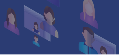
Exhibit Opportunity ($2,500):

Virtual Booths are the new format with the same dates and will still include 2 full conference passes, booth promotion, and lead capture for follow up. Additionally, in this new environment you will be able to upload promotional videos, logos, branding and schedule one on one video chats, private demos and more. Official booth dates are 2/1 to 2/5.