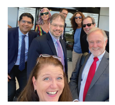
AIPLA's IP Practice in Latin America Committee 2023 Trip Delegation